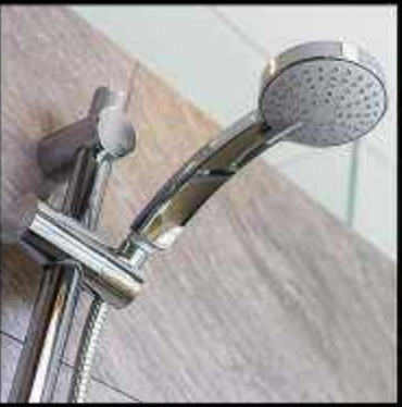
PREMIUM CP FITTINGS - BY GROHE