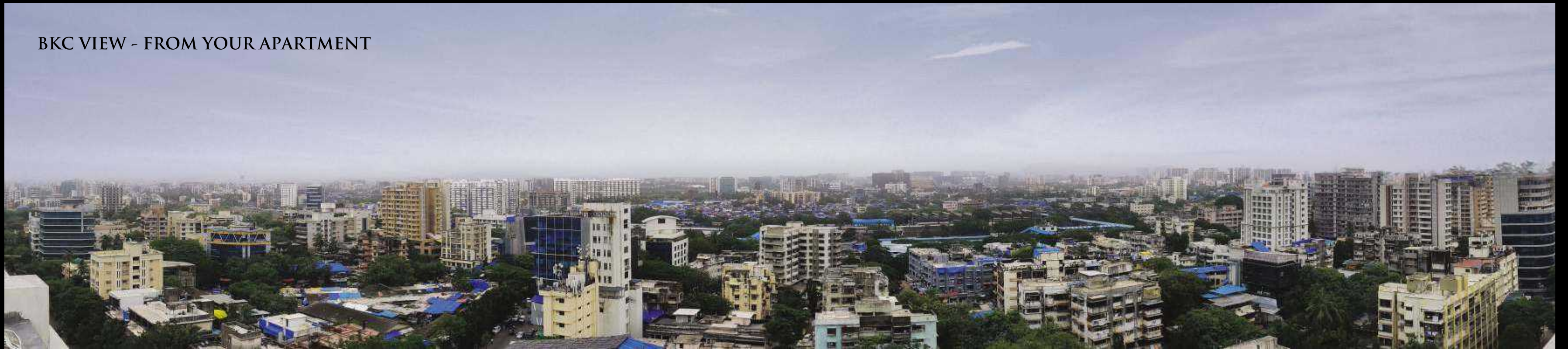
BKC VIEW - FROM YOUR APARTMENT

A WORLD WITH A SPLENDID VIEW AS FAR AS YOUR EYES CAN SEE