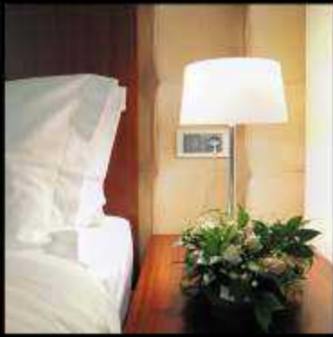
ENERGY EFFICIENT SENSOR LIGHTING - BY VIVINT SMARTHOME