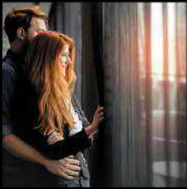
SOUNDPROOF WINDOWS - BY ARCCON