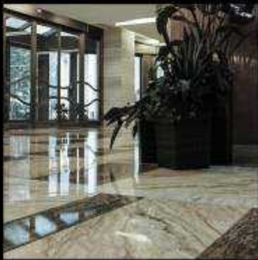
ITALIAN MARBLE FLOORING