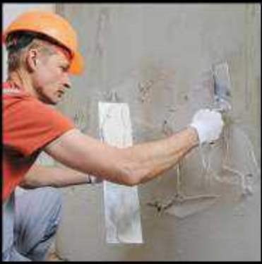
GYPSUM & CEMENT - BY SAINT GOBAIN GYPROC & AMBUJA