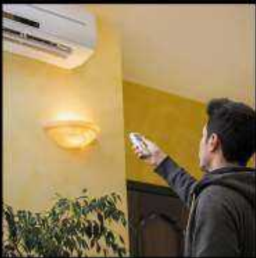
SPLIT AIR-CONDITIONING - BY HITACHI