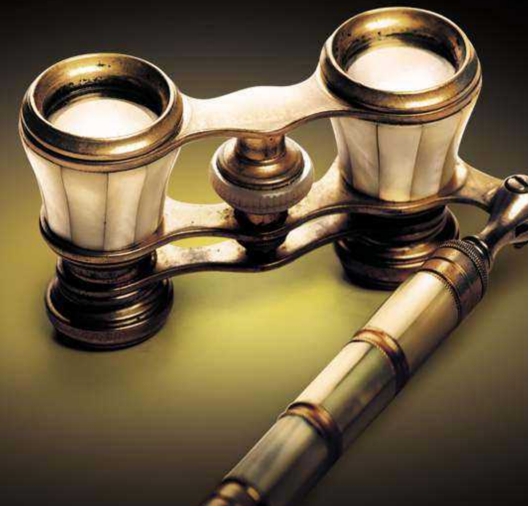
PALI HILL VIEW - FROM YOUR APARTMENT