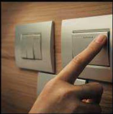
SWITCHES & ELECTRICALS - BY LEGRAND & POLYCAB or EQUIVALENT MAKE