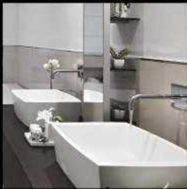
5 FIXTURE BATH FITTINGS & SANITARY WARE - BY TOTO, JAPAN